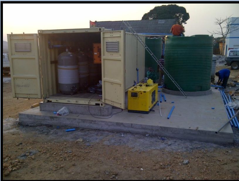
Containerised Filtration Plant Angola 20m 3 / hour