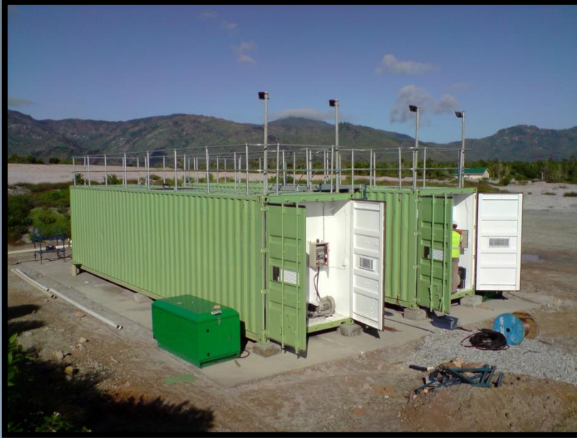
Containerised Sewage Plant Madagascar 80m 3 / day