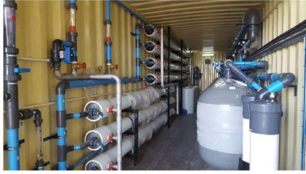
30m 3 /hr Containerised Reverse Osmosis Plant - South Africa