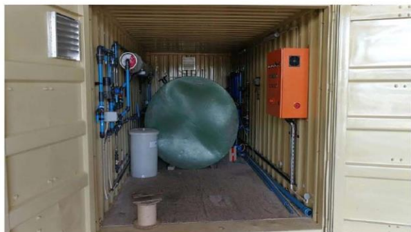
3m 3 /hr Containerised Reverse Osmosis Plant - Botswana