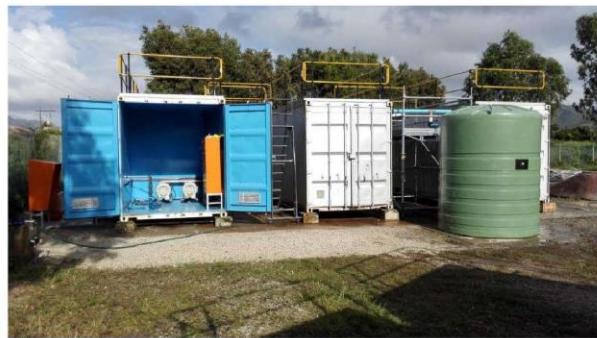
180m 3 /day Containerised Sewage Treatment Plant - Madagascar