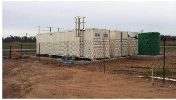
135m 3 /day Containerised Sewage Treatment Plant - South Africa