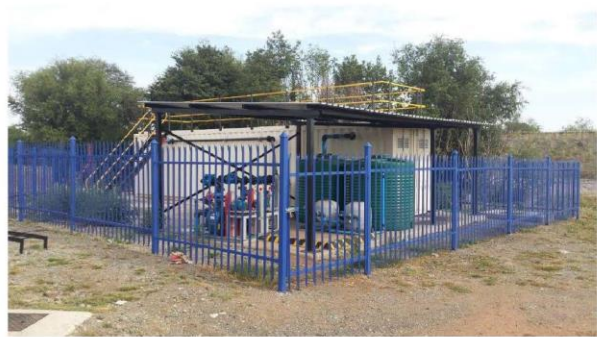
40m 3 /day Containerised Sewage Treatment Plant - South Africa