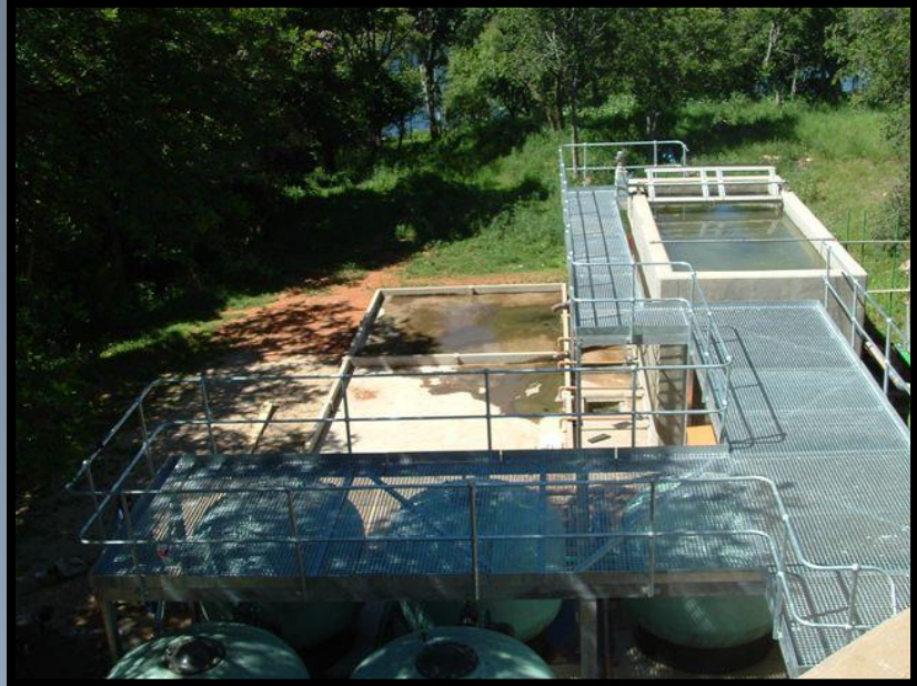
Demin Water Plant Zambia 60m 3 /hour