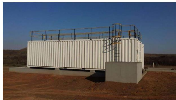
80m 3 /day Containerised Sewage Treatment Plant - South Africa