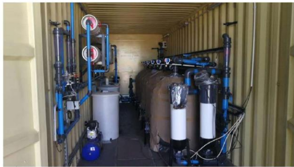
8m 3 /hr Containerised Reverse Osmosis Plant - Botswana