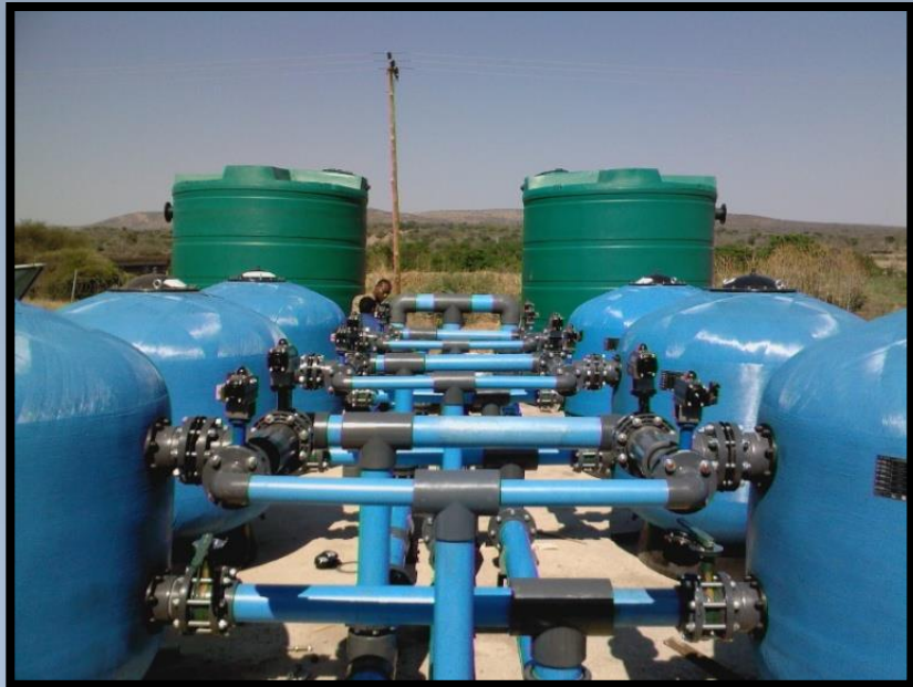
Potable Filtration Plant Marble Hall 180m 3 / hour