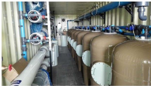
25m 3 /hr Containerised Reverse Osmosis Plant - South Africa